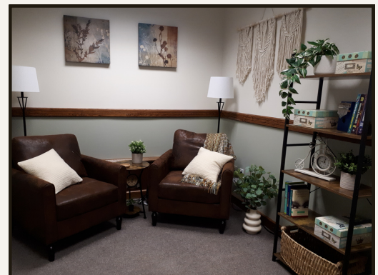
10 Missassaga St. E., Orillia